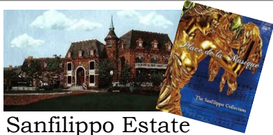
Sanfilippo Estate Barrington, IL

Wednesday March 19, 2025 $149pp (credit card price $155) 9:30 am Estate Tour & Lunch