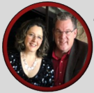
Call for Group Pricing

Wednesday Nov. 19, 2025 $59pp/$119 w/bus (credit card prices $62/$124) White Fence Farm 12pm Lunch / 1pm Show